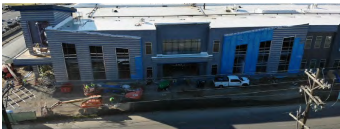
Drone shot of the main Broadway entrance