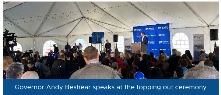
Governor Andy Beshear speaks at the topping out ceremony

On Wednesday, October 18, Norton Healthcare held a topping out ceremony for its hospital being constructed on the Opportunity Campus – the first hospital west of Ninth Street in more than 150 years. Goodwill joined in on the celebration, which included installation of the final steel beam.