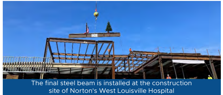
The final steel beam is installed at the construction site of Norton's West Louisville Hospital