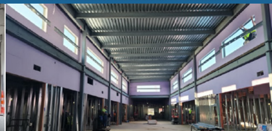
Clerestory windows being installed above Atrium