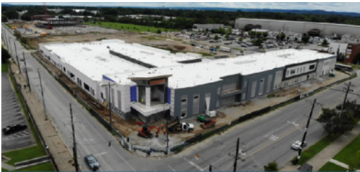
Drone shot from corner of 28 th & Broadway