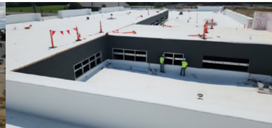
From second floor roof looking down to low roof