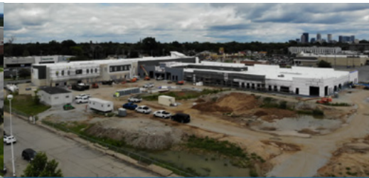
Drone shot from NIA parking lot facing downtown