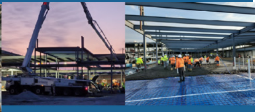
Final concrete slab pour.