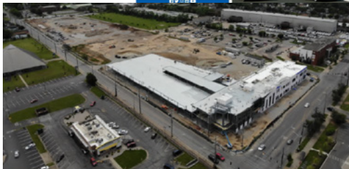
Drone shot from corner of 28 th and Broadway