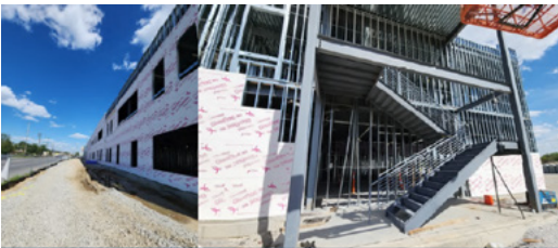
Installation of exterior sheathing and stair tower.