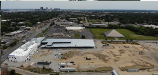
Drone shot looking east towards downtown